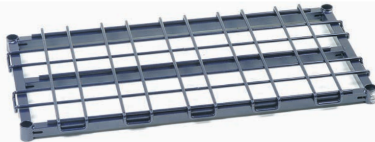
Heavy Capacity- Up to 1600 lbs. per Shelf