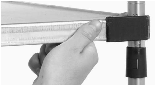
PLASTIC SHELF CLIPS LOCK INTO PLACE ON POSTS FOR QUICK 1" ADJUSTMENT.