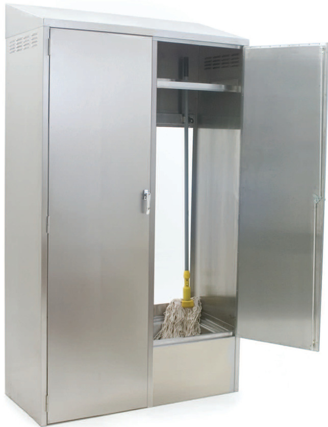
(mop shown not included)

The new Double-Width Mop Sink Cabinets is the perfect storage unit for all of your cleaning supplies and equipment. One side features three intermediate shelves for storage, and the other side features an overhead shelf, two-pole mop holder and a 16" x 20" x 8"-deep mop sink with drain. The 84" height allows for plenty of space to store all of your cleaning supplies, mops, and mobile mop bucket. Other features include louvers along the top of each side panel for ventilation, a sloped top for ease of cleaning, service faucet, 30" hose and wall mounted bracket. Available with mop sink on the left- or right-hand side.