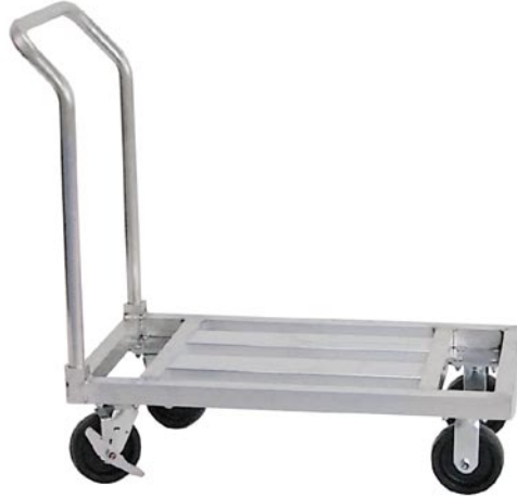
DRC2436MHD/HD24 Mobile Unit w/Optional Handle