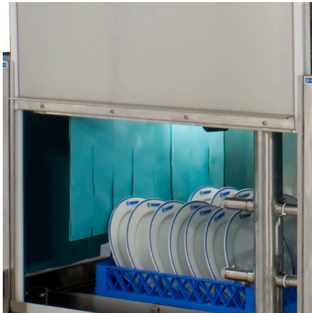
Telescoping Doors —no issues with low ceilings. The doors also provide wide access to the interior of the machine for quick and efficient daily maintenance.