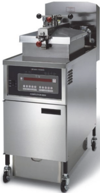
PFE 500 electric pressure fryer with Computron™ 8000 control

Henny Penny first introduced commercial pressure frying to the foodservice industry more than 50 years ago. Frying under pressure enables lower cooking temperatures for longer oil life, and faster cooking times to meet peak demand. Pressure also seals in food's natural juices and reduces the amount of oil absorbed into product.