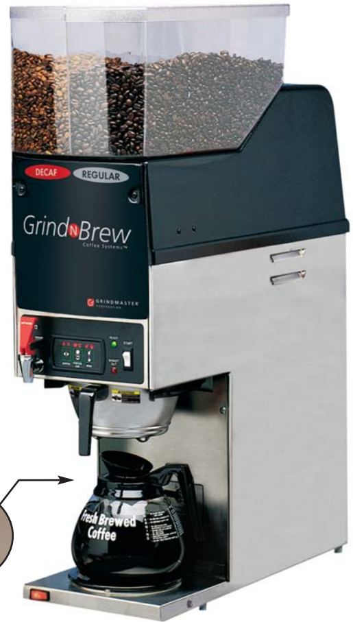
Model 21H (Decanter sold separately)